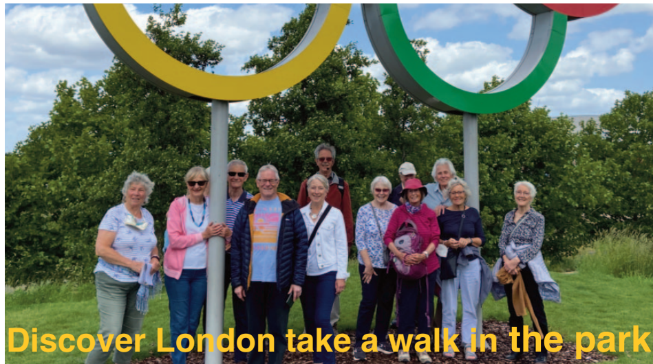
Discover London take a walk in the park

A monthly feature to spotlight the interest groups and activities available to Malling u3a members.