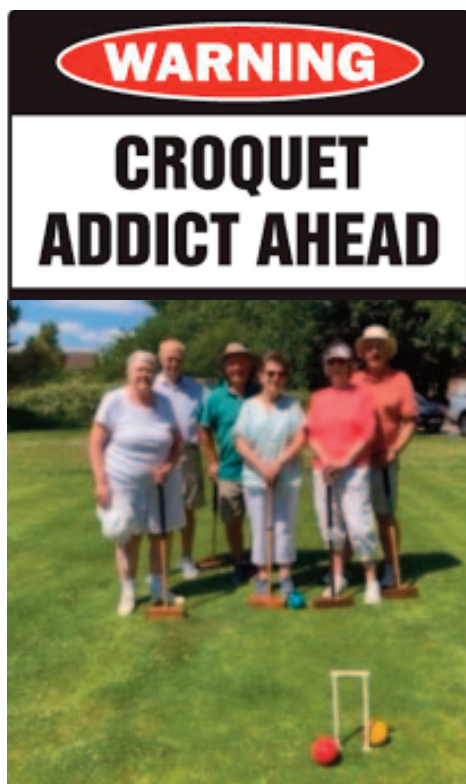
Hammer heads: we have been meeting seasonally for around ten years now at the Medway Croquet Club, Aylesford.

T he Malling u3a Croquet Group has been meeting seasonally each Tuesday morning for around ten years now which is hosted by the Medway Croquet Club based in Aylesford.